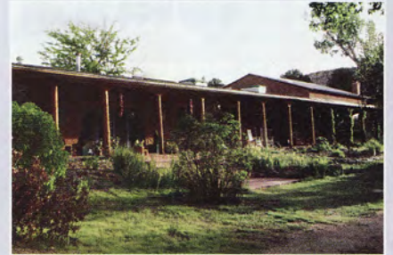
Hacienda Las Barrancas www.haciendalabarrancas.com