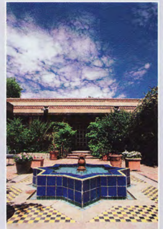
Los Poblanos Historic Inn & Cultural Center www.lospoblanos.com