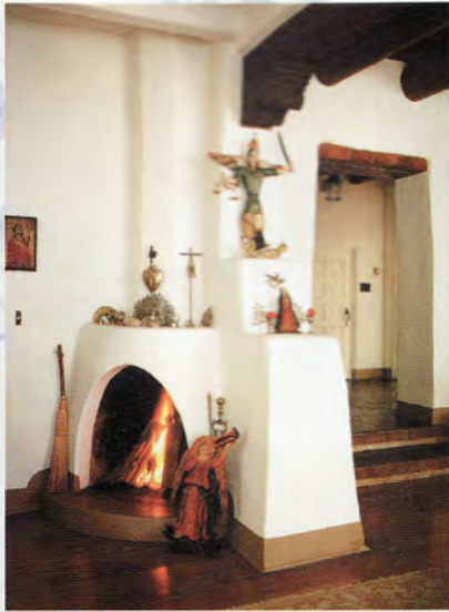
Los Poblanos Historic Inn & Cultural Center