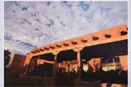
High Feather Ranch www.highfeatherranch.com