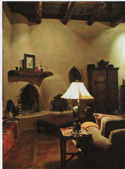
High Feather Ranch