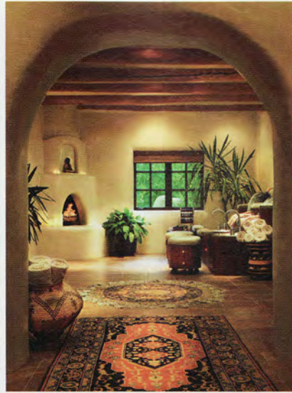
El Monte Sagrado Living Resort and Spa