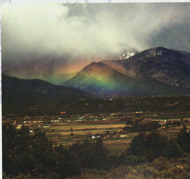
The view from El Monte Sagrado, near Taos

such as a circular common room with 270-degree views of the Río Grande Gorge. The B&B is an Earthship, a term coined by Taos-based architect Michael Reynolds for his structures, which generate their own power and water through solar energy and catchment systems. In keeping with this vision, the inn's energy comes from 28 solar panels that cascade down