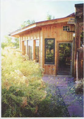
Silver River Adobe Inn www.silveradobe.com