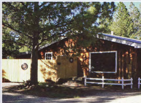
Cimarron Rose B&B www.cimarronrose.com