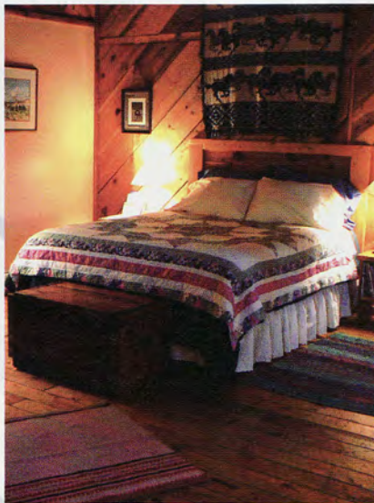
Cimarron Rose B&B