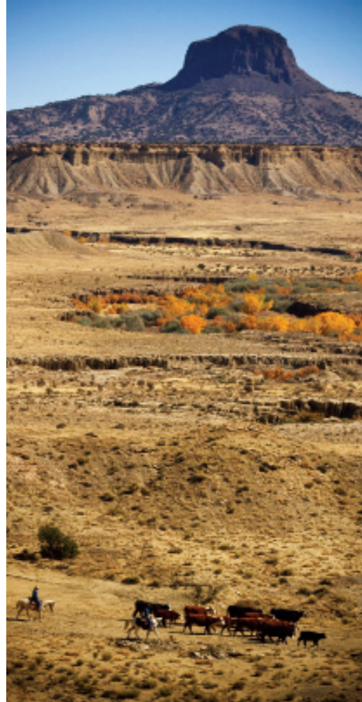
From left: The doorways of Pueblo Bonito, at Chaco Culture National Historical Park, lead adventurers into the past. Hot-air balloons glide from Bloomfield to Farmington during the San Juan River Balloon Rally. Ranchers herd cattle in the shadow of Cabezon Peak.