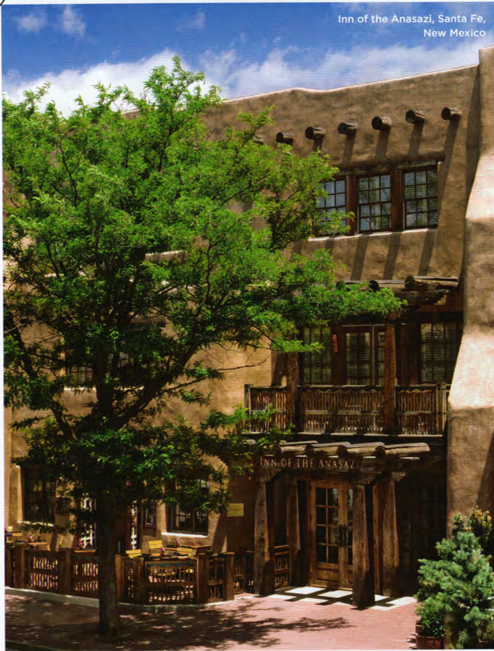
Inn of the Anasazi, Santa Fe, New Mexico