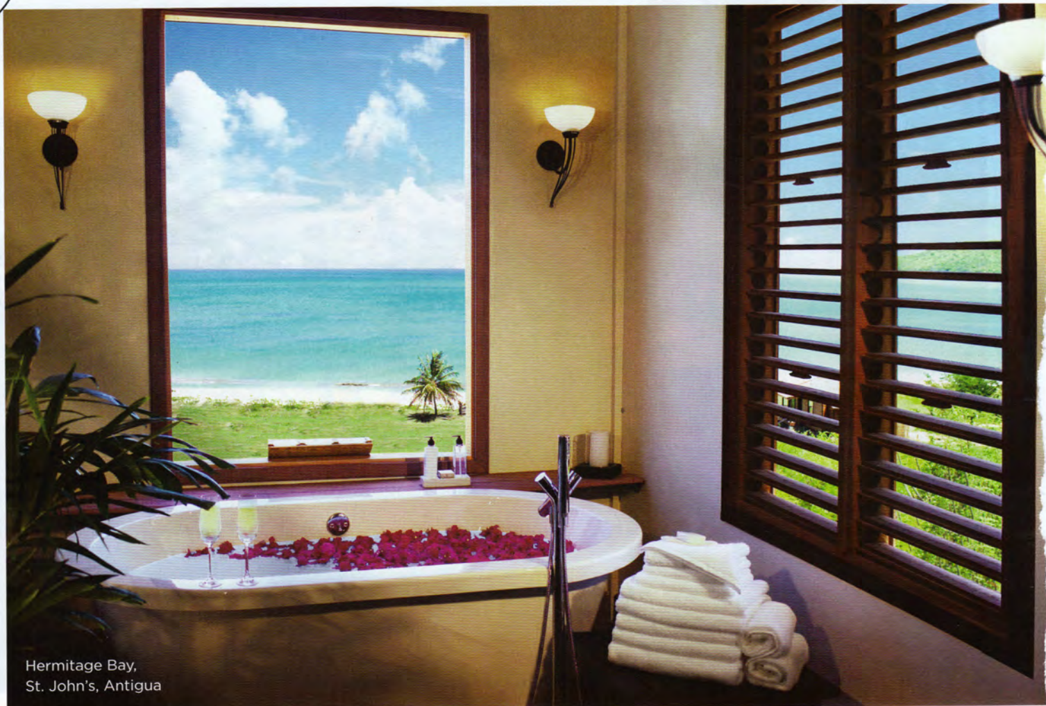
Hermitage Bay, St. John's, Antigua