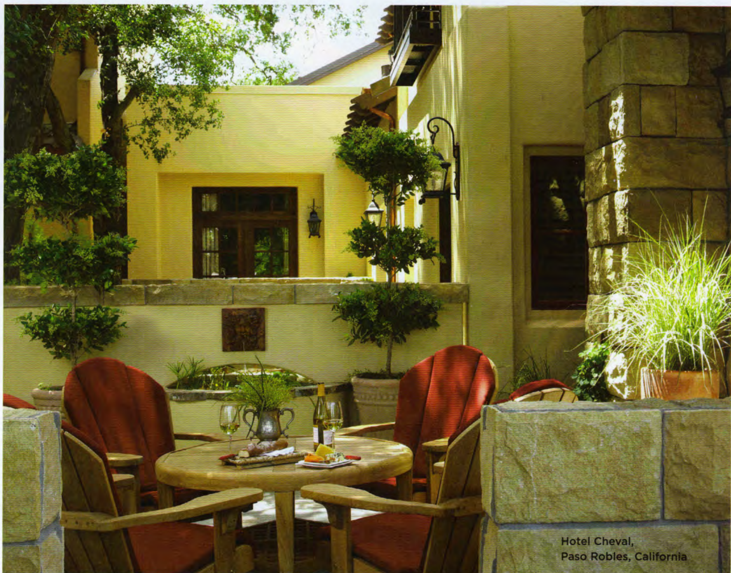
Hotel Cheval, Paso Robles, California

harbor cruise. Rent bicycles from the hotel and pedal over to Mother's Beach, which is known for its gentle, kid-friendly waves, or to Venice Beach, which is great for people-watching, shopping and sunning.