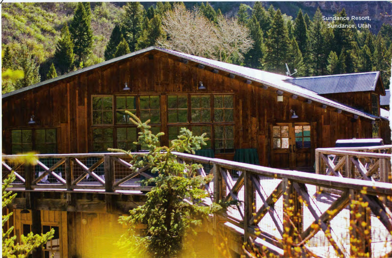
Sundance Resort, Sundance, Utah