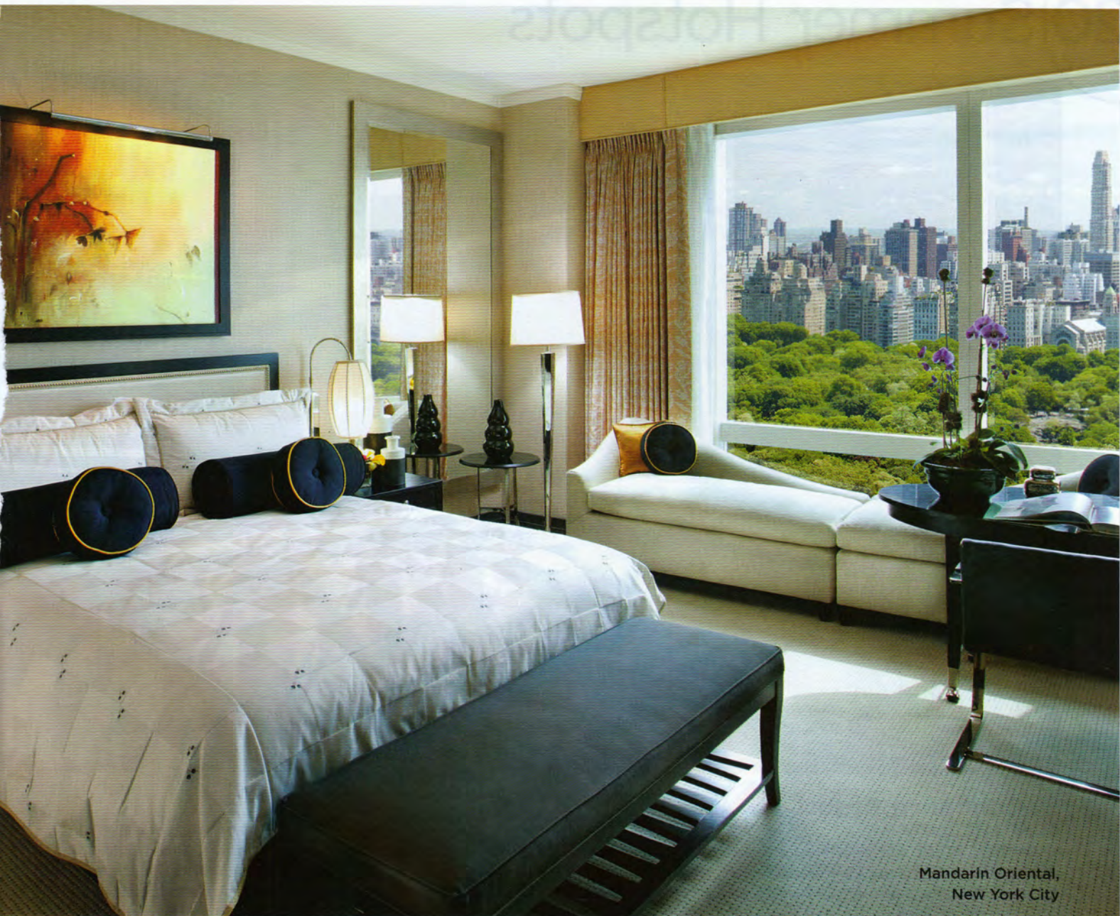
Mandarin Oriental, New York City