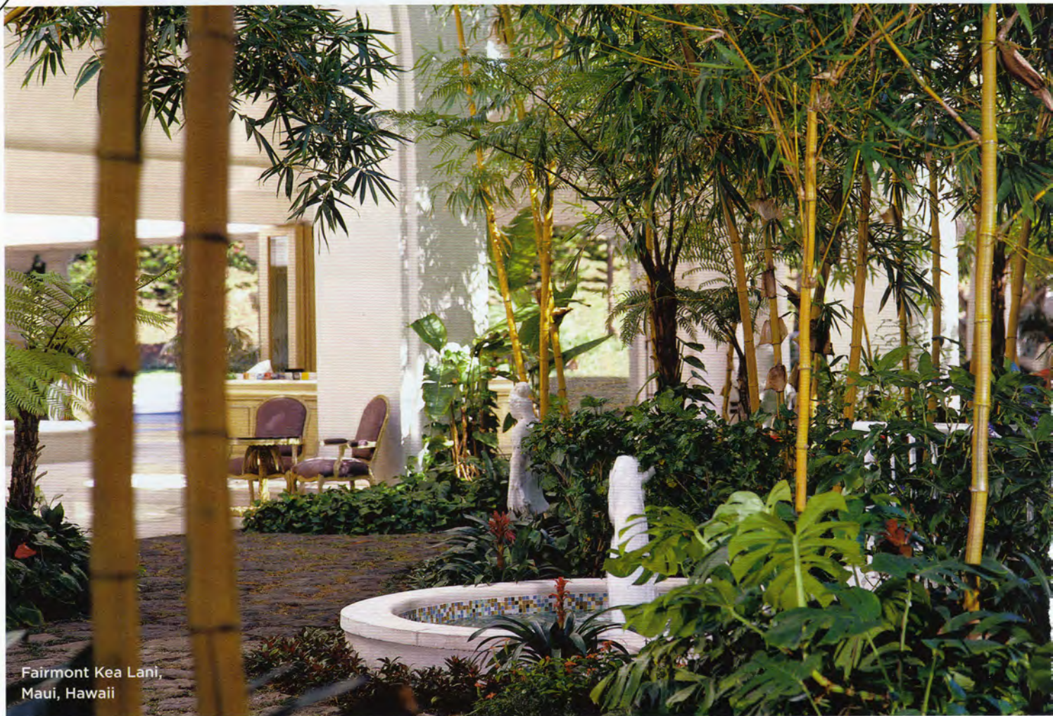
Fairmont Kea Lani, Maui, Hawaii